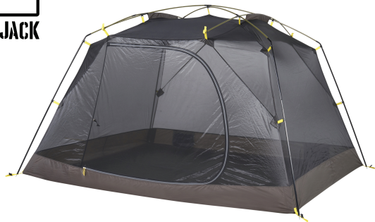
Rough House 4 Pictured

In order to familiarize yourself with your new tent, we recommend you “test pitch” it before your first camping trip. For technical support please visit www.slumberjack.com .